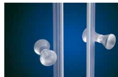
Eccentrico / Regulable