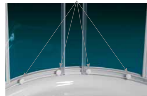
Eccentrico / Regulable