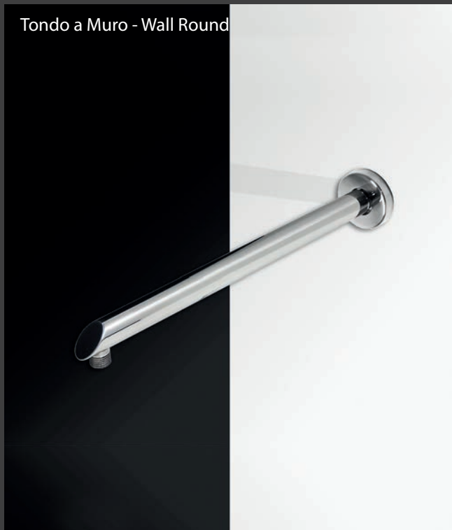
Tondo a Muro - Wall Round